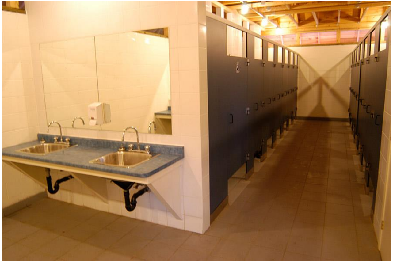
Clean Student Facilities