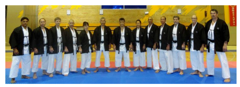
IKD Shihan-kai in Judge's uniform